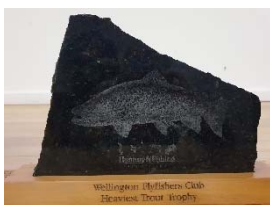
2022 Graeme McIntyre