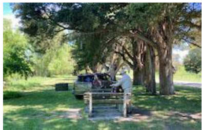
Lunch table at the Cliffs