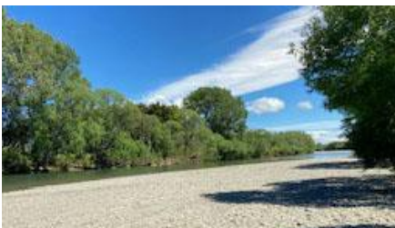
The river at Cliffs.